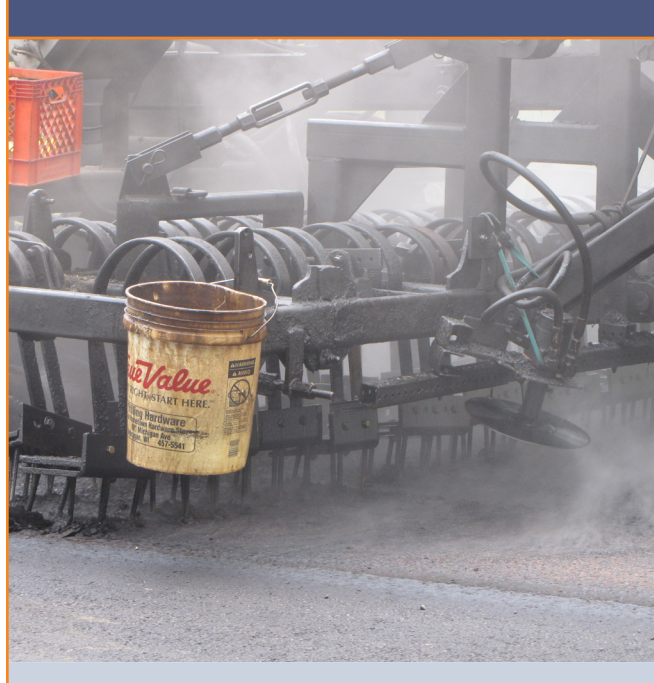
Wednesday's afternoon sessions will provide an overview of preventative maintenance options for pavements and bridges